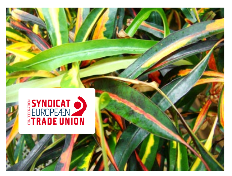
Colour version with a flag on a multi-coloured background