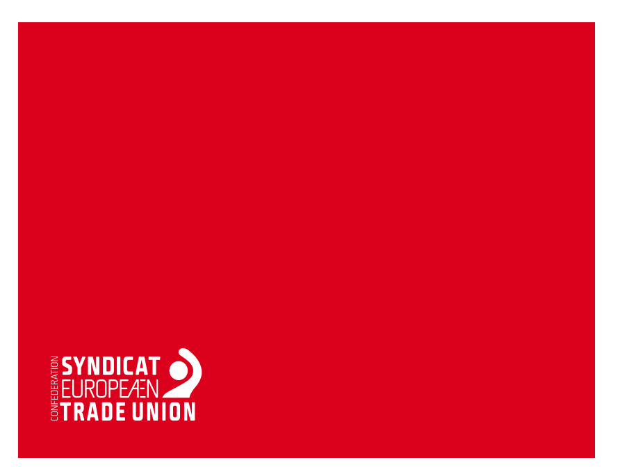
White version knocked out against a monochrome background

When shown against a coloured background, the logo should preferably be knocked out (i.e. left in paper white) rather than placed inside a flag. However, a flag should be used where the background would make the logo difficult to read.